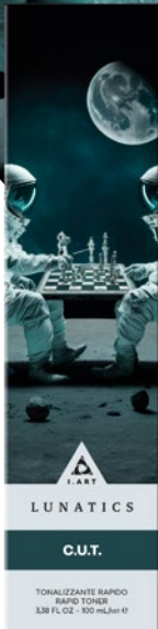
C.U.T. BLUE GREY