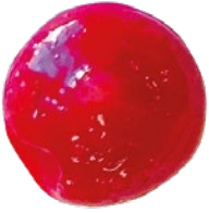
VASSILY PURE COLOUR

SUPER CONCENTRATED COLOURS, INTERMIXABLE AND DILUTABLE WITH ANGELO, TO ACHIEVE A PASTEL EFFECT