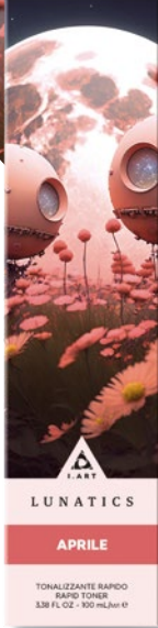
APRILE ROSE GOLD