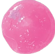
VASSILY DILUTE COLOUR