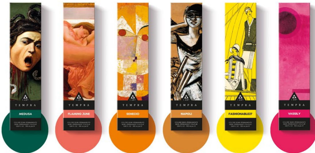
MEDUSA DARK GREEN